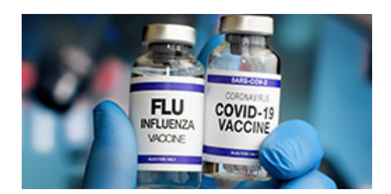
Flu and COVID-19 Vaccination Deadlines are December 1, 2023

Get help now by contacting the EEC at <u>949-824-0500</u> or accessing the <u>EEC support site</u>.