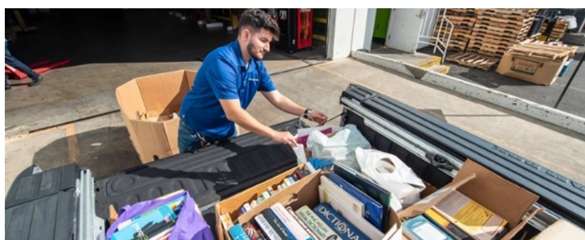
Transportation & Distribution Services student worker gathering books from the book drive.

Article provided by Procurement Services and Environmental Health & Safety